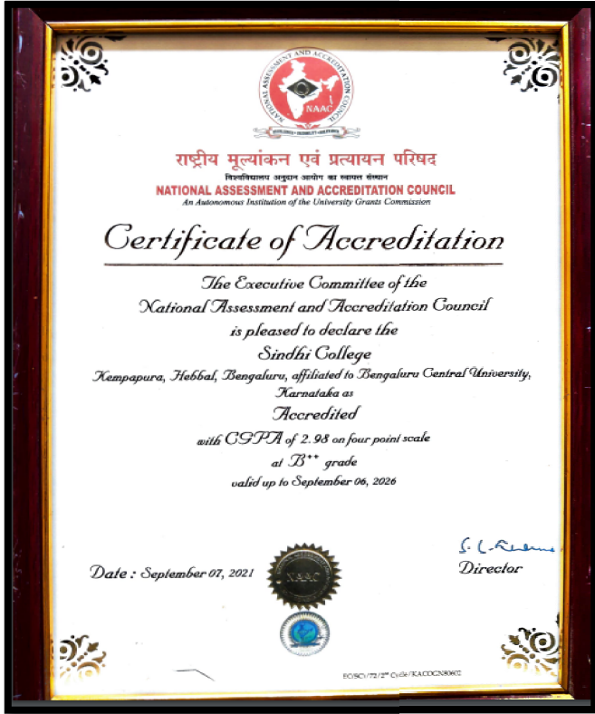
Recognition of College under 2(f) and 12(B) of the UGC Act 1956